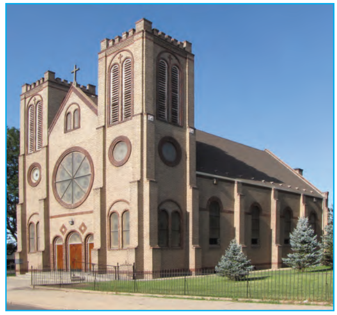
Holy Rosary church.