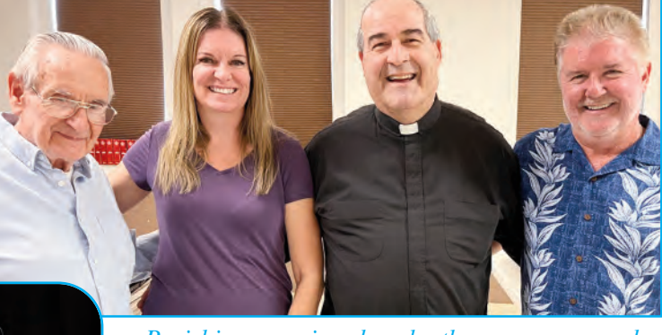
Parishioners enjoyed each others company and brought pictures of joyful past events.