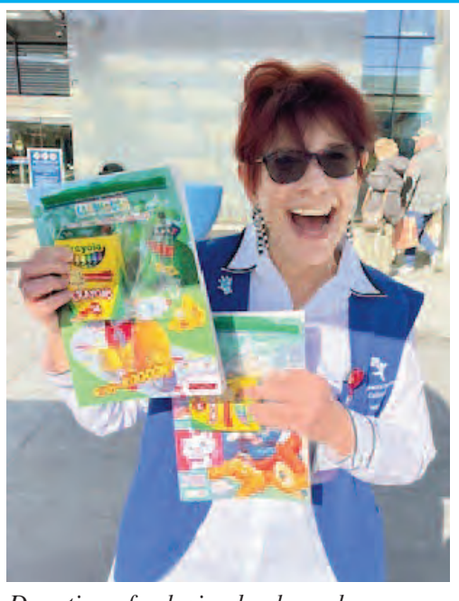
Donation of coloring books and crayons.